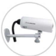
Live and Recorded Video