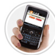
Send Commands From Your Phone