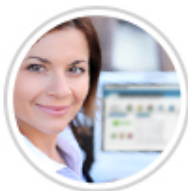
Easy Web Access and Controls