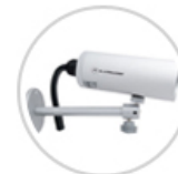
Live and Recorded Video