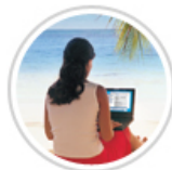
Reports and Alerts Wherever You Are